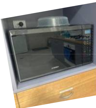
Upgraded items in our Stage 1 kitchen

Our staff love the new vacuum mop and bedside tables on wheels mean they can get the cleaning done quicker.