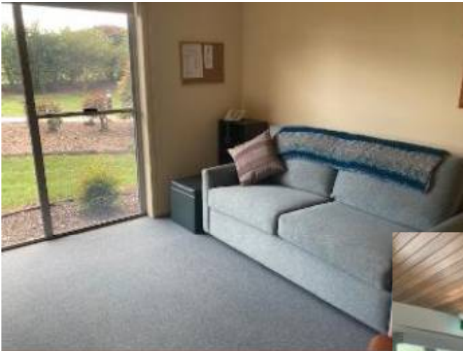
A new sofa bed for our family room

Gippsland Rotary Centenary House is extremely grateful for the long term support provided by the Keith Chenhall Charitable Trust. Past generous contributions have funded maintenance works, replacement of worn or broken equipment and furniture as well as purchase of new items. The latest support of $5,000 has again enabled us to replace and upgrade various items throughout the house.