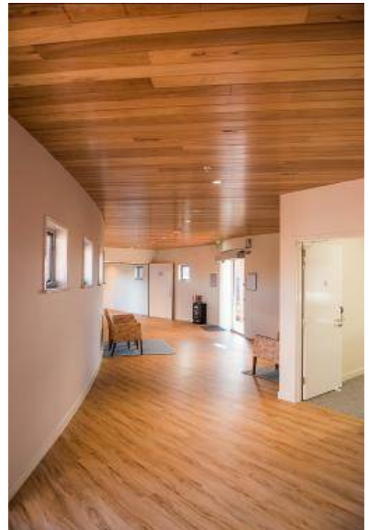
Above: The entrance area with the door leading to the path to hospital.