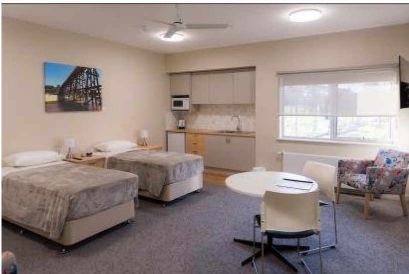
Left: A guest room in the new stage.