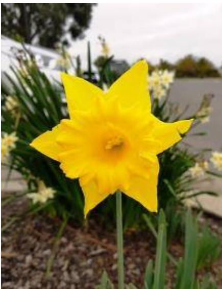
Daffodil in the GRCH gardens

The new guest rooms are adorned by magnificent large canvas prints reproduced from the Gippsland Calendar photographs. Our first residents have already made many comments of their pleasure in recognising the local landmarks from across the region. (Read more on page 4)